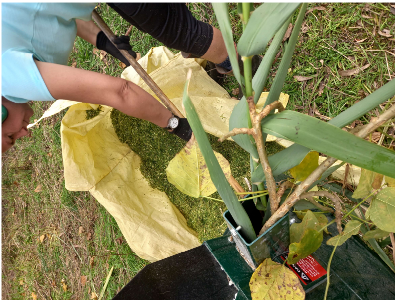
Flame Tree and Elephant grass chips easily