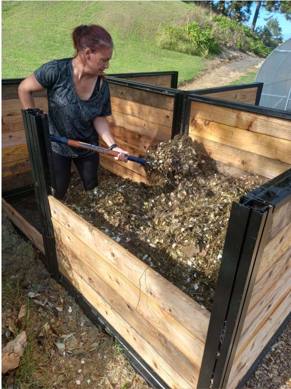
Carbon Cycle bins