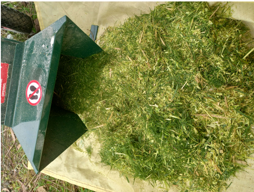
Flame tree and Elephant grass chipped