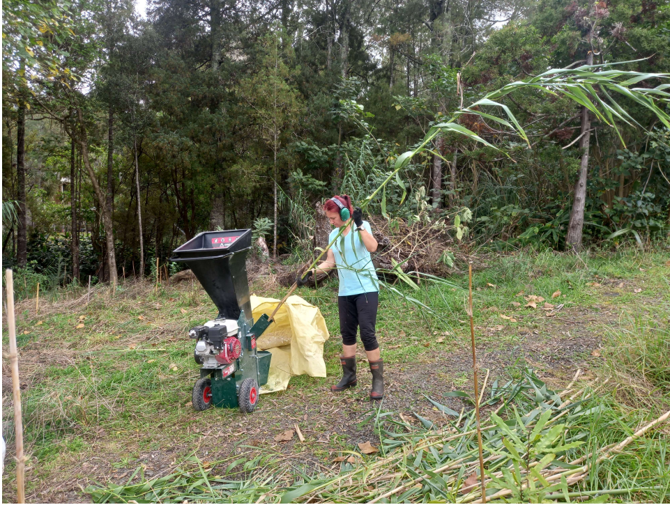
Masport Shredder Shipper