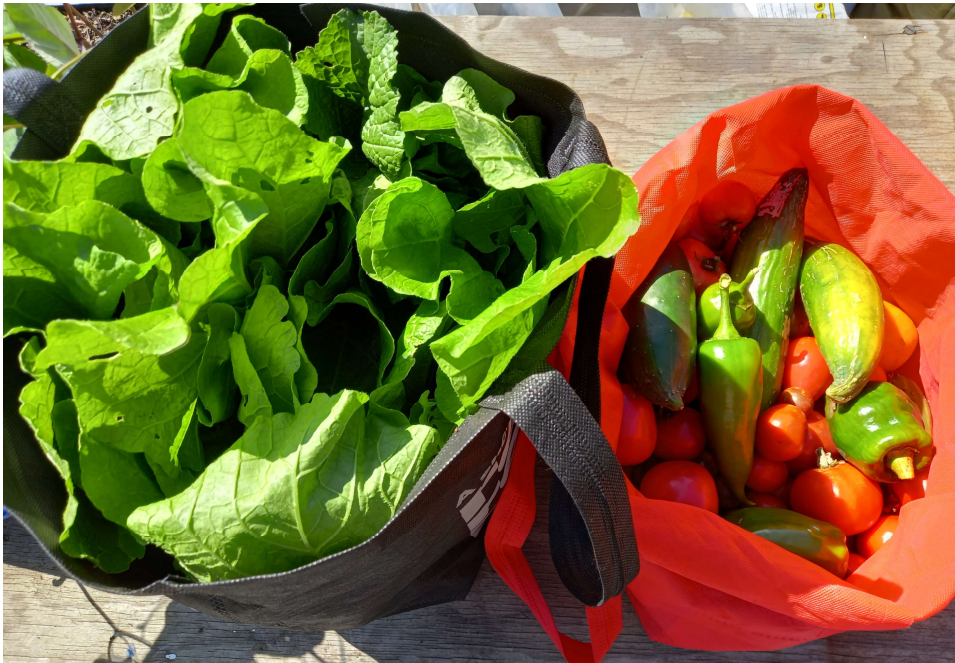
Kai for Hospital kitchens and SIQ