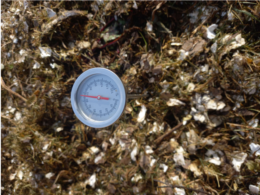
Packaging, cardboard and garden waste compost